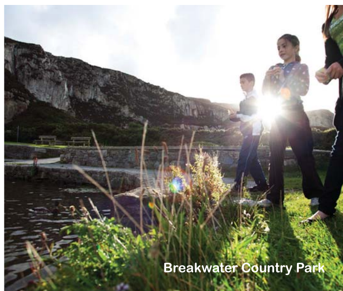
Breakwater Country Park